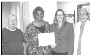
Sandy & Dare Center Staff

G.E.M. provided two screenings for our 6th year on National Memory Screening Day (11/15) and of the 25 people five were referred for further evaluation. GEM thanks